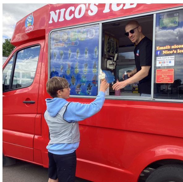
Year 6 – SATS treat

We are so proud of the resilience and ambition our Year 6 pupils have demonstrated through their SATs. They worked incredibly hard and should be proud of their achievements. At the end of SATs week they enjoyed some well-deserved free time with their friends and had a treat from the ice-cream van. The ice-creams were delicious. We used our fund raising money to pay for their treat. Thank you for all your generous donations!