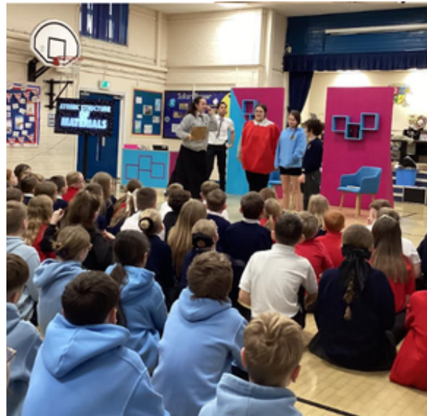
Year 5 & 6